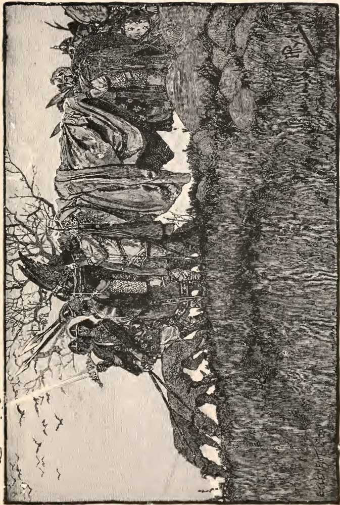
THE DEATH OF SIEGFRIED